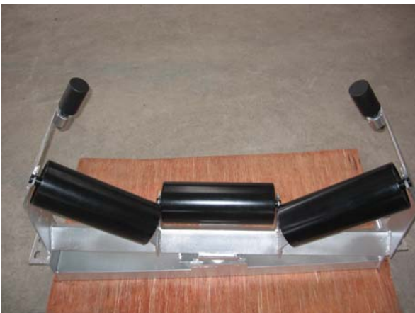
Self-tracking Carrier Rollers