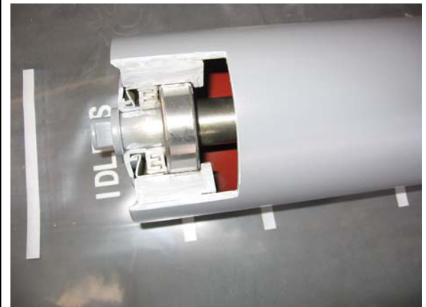
Cut-sample showing bearing housing