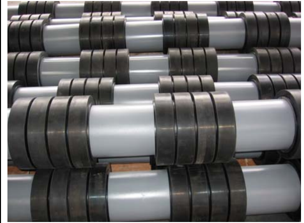
Return Rollers with Buffer Rings