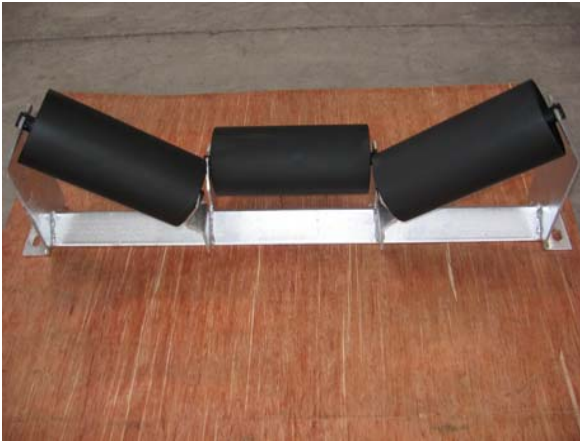
Carrier Rollers with Brackets