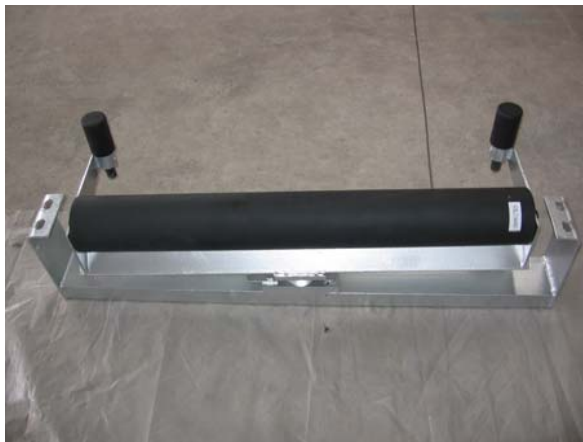
Self-tracking Return Rollers