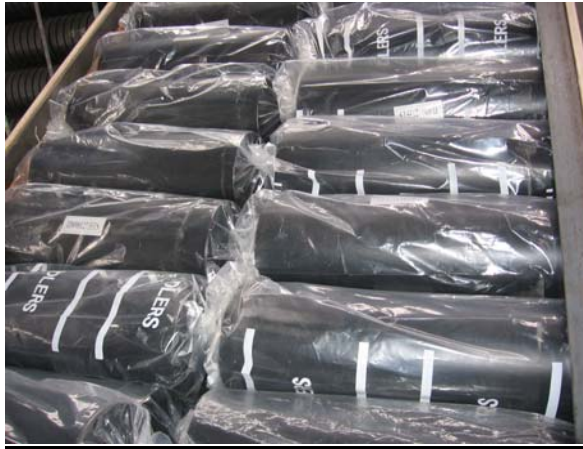
Rollers with Plastic Packaging